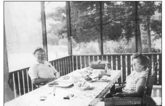
Picnic on the porch, circa 1957

If you would like membership information about the club or would like to arrange to visit the club and learn more about it, please call the club at 672-3309.